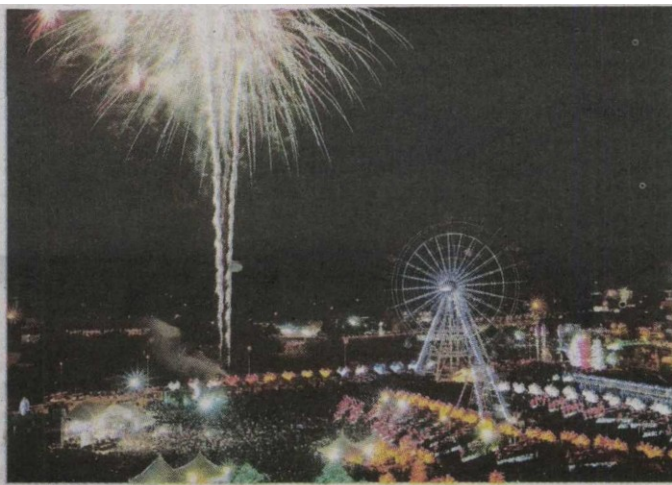
City of Digital Lights at i-City.