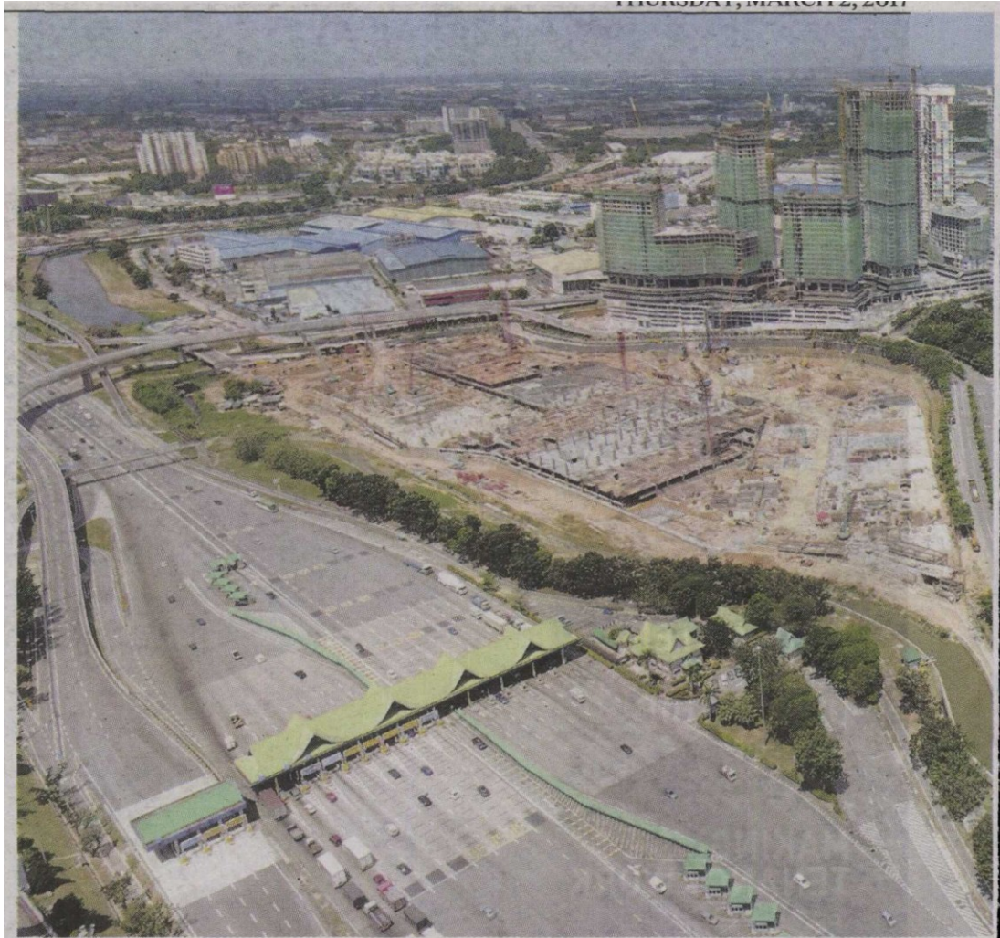
i-City aerial view.