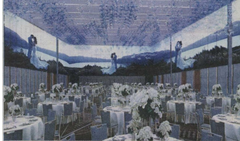
Axis Lounge at DoubleTree by Hilton.