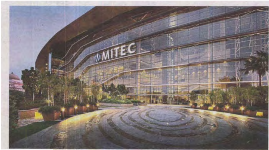
MITEC cost RM628mil to build and was designed to meet the demands of the city's growing MICE industry.