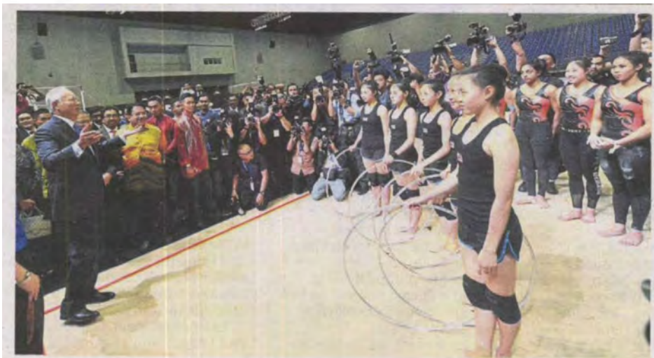
Najib (left) showing support to the national gymnastic team.