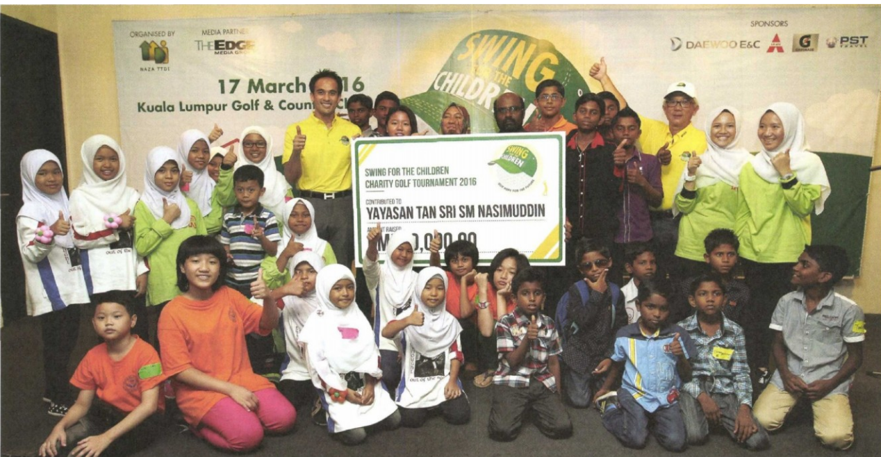
Beneficiaries of Swing for the Children 2016, represented by children and helpers of Ti-Ratana Welfare Society, Pertubuhan Kebajikan Yesuvin Mahligai Selangor and Pertubuhan Rumah Amal Cahaya Tengku Ampuan Rahimah