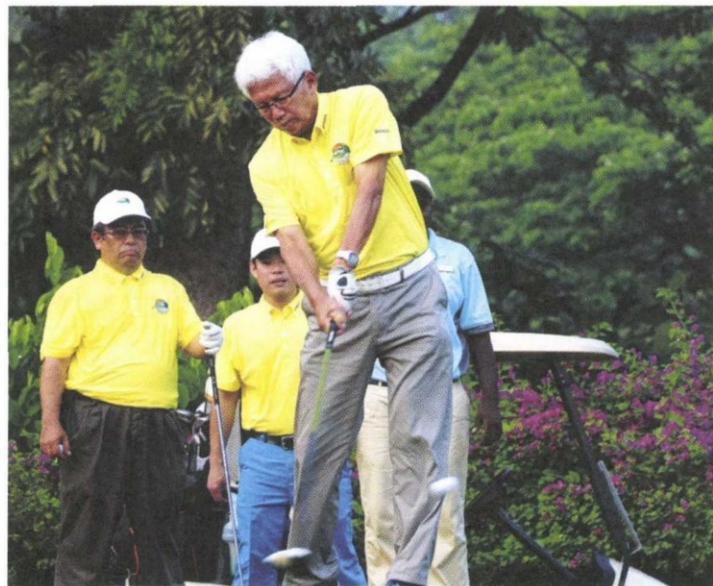
Tan Sri Asmat Kamaludin in full concentration