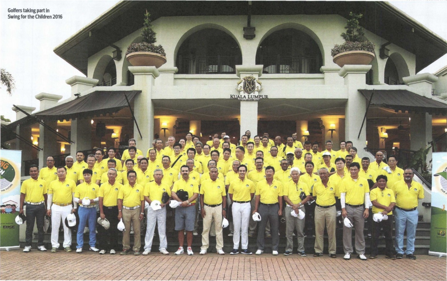
Golfers taking part in Swing for the Children 2016